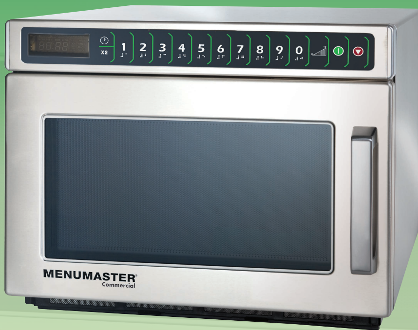
Model DEC18MC shown